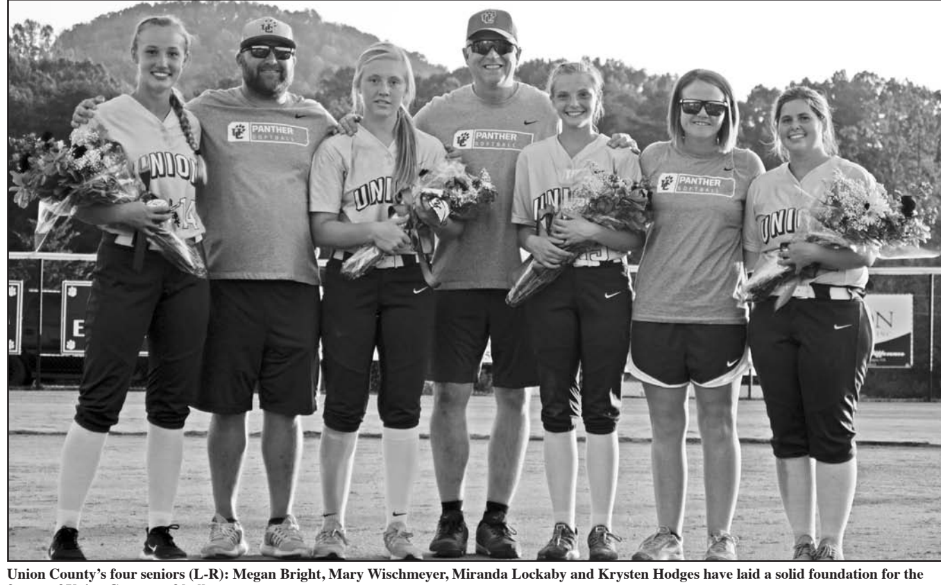
future of Union County softball.

too many mistakes.' Vidalia would take advantage of a one-out error to make it a 5-1 game in the second, then use a leadoff single to push the margin to 6-1 in